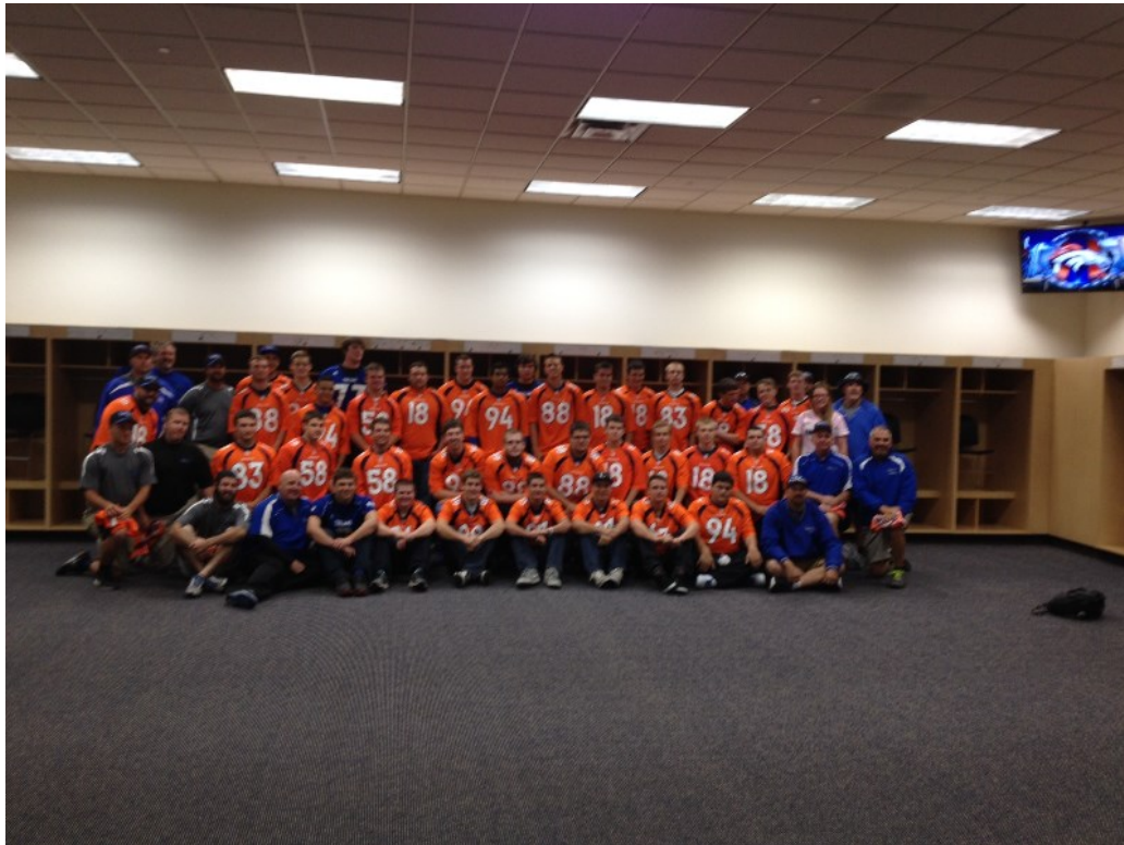
Longmont Football Team at Mile High Stadium

On September 5th the football team was recognized on the Today Show to highlight the team's "Day of Service" that took place during the summer. The team was invited to attend the Sunday Night game against Indianapolis and the spot recorded by NFL Films was aired during halftime. NFL Films is planning on a compilation showcasing football teams from across the country to air before or during the Super Bowl.